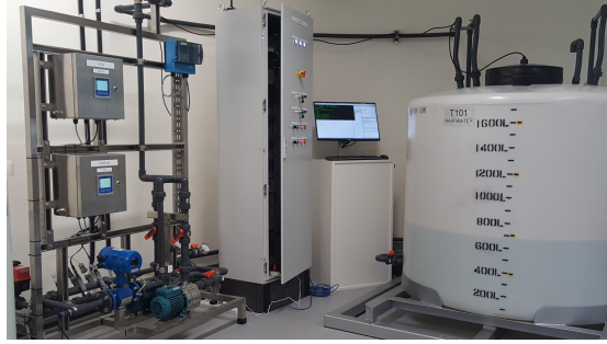
Fig. 6: Process P1 (raw water treatment) – SWaT testbed